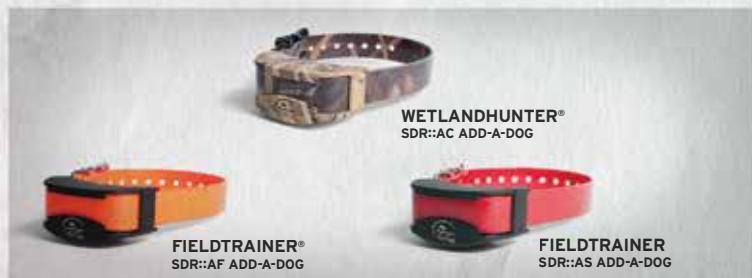
WETLANDHUNTER® SDR::AC ADD-A-DOG