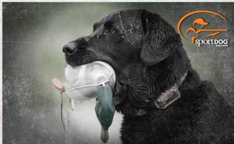
SPORTDOG BRAND® ADD-A-DOG® COLLAR RECEIVERS