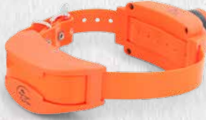
SDR-AB ADD-A-DOG COLLAR

ORIGINAL COLLAR RECEIVER & BEEPER FOR: SD-1875