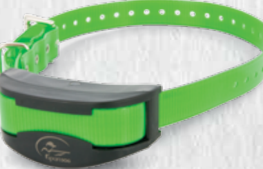
SDR-A ADD-A-DOG COLLAR

ORIGINAL COLLAR RECEIVER FOR: SD-425CAMO