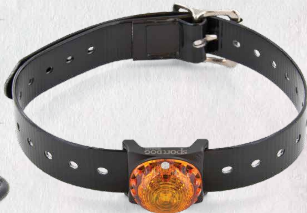
SHOWN ON 1" COLLAR STRAP