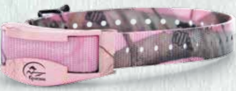
SDR-AP ADD-A-DOG COLLAR

ORIGINAL COLLAR RECEIVER FOR: SD-425PINK