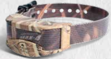
SDR-AC ADD-A-DOG COLLAR

ORIGINAL COLLAR RECEIVER FOR: SD-425PINK