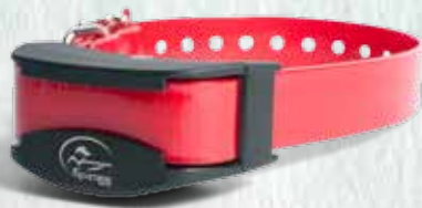
SDR-AS ADD-A-DOG COLLAR

ORIGINAL COLLAR RECEIVER FOR: SD-425 & SD-825