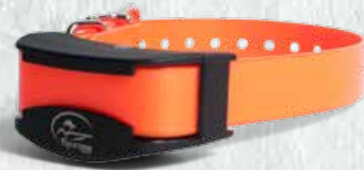
SDR-AF ADD-A-DOG® COLLAR

ORIGINAL COLLAR RECEIVER FOR: SD-425 & SD-825