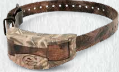
SDR-AW ADD-A-DOG COLLAR

ORIGINAL COLLAR RECEIVER FOR: SD-1225, SD-1825 & SD-2525