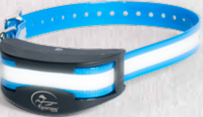
SDR-AH ADD-A-DOG COLLAR

ORIGINAL COLLAR RECEIVER FOR: SD-1825CAMO