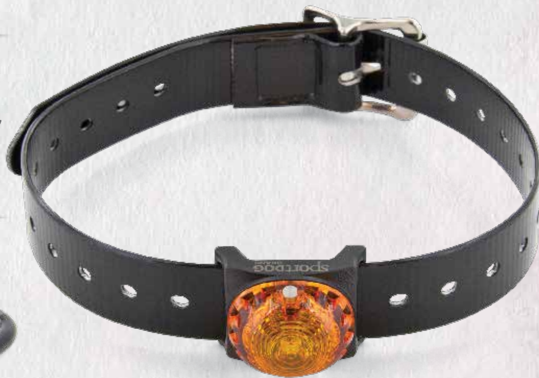
SHOWN ON 1" COLLAR STRAP