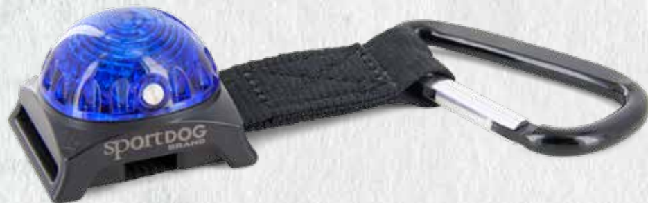
SHOWN WITH INCLUDED CARABINER ATTACHED